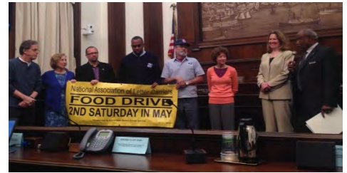
City Proclamation for “Stamp Out Hunger”