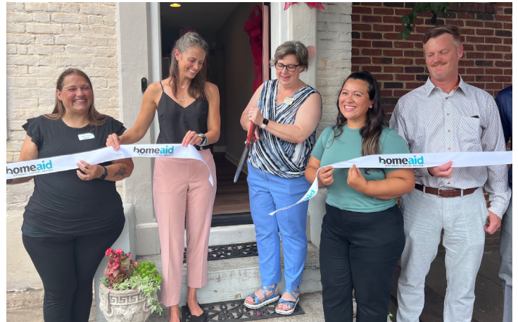
HomeAid and Richmond American Homes organized 21 trade partners to make ALIVE! House Renovations